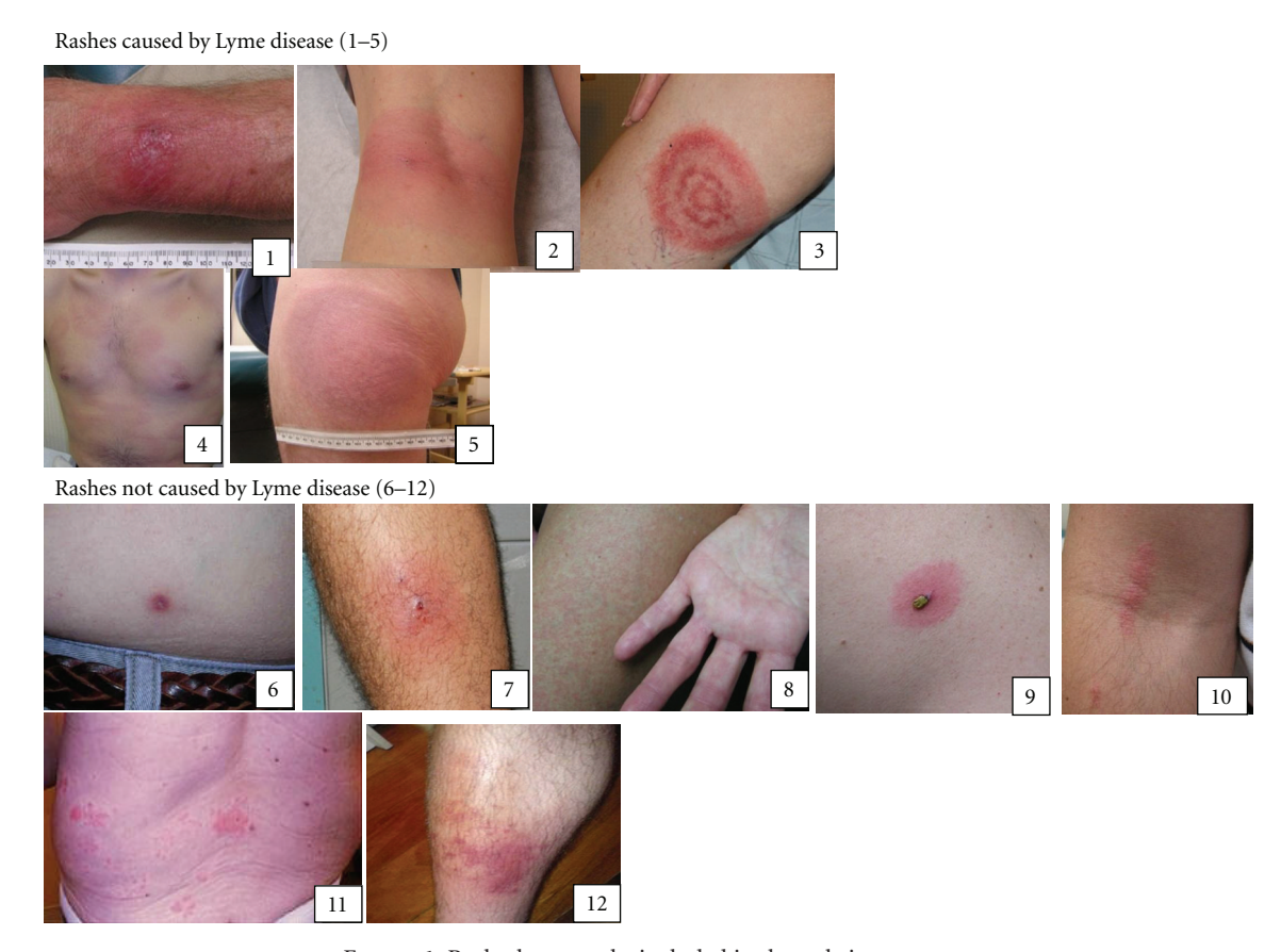
FIGURE 1: Rash photographs included in the website survey.

that the classic target EM was not due to LD, 40.2% incorrectly identified the vesiculopustular EM, 25.7% incorrectly identified the uniformly red EM, 43.6% incorrectly identified the disseminated EM, and 33.0% incorrectly identified the blue-purple EM. The survey included two non-Lyme rashes that are commonly misdiagnosed as being caused by LD. Of those who gave a response on all twelve rashes, 34.2% incorrectly identified the attached tick with an immediate skin reaction (Figure 1, number 9) and 10.7% incorrectly identified the rash from cellulitis (Figure 1, number 12) as being caused by LD. 12.3% incorrectly identified the small tick-bite reaction (Figure 1, number 6), 14.1% incorrectly identified the rash due to Staphylococcus aureus (Figure 1, number 7), 6.8% incorrectly identified the rash due to hand-foot-mouth disease (Figure 1, number 8), 4.8% were incorrect in identifying the poison ivy rash (Figure 1, number 10), and 6.9% incorrectly identified the rash due to shingles (Figure 1, number 11) as being caused by LD.