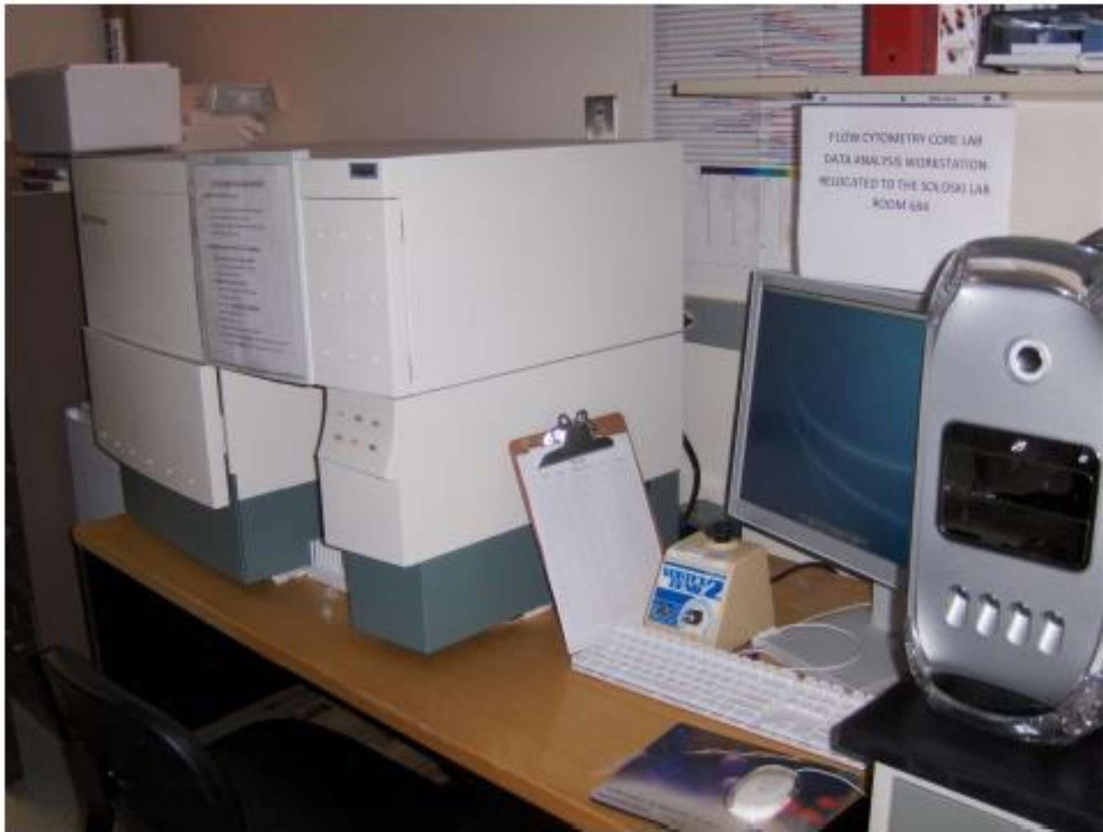
SIX PARAMETER SYSTEM WITH 2 LIGHT SCATTER AND 4 FLUORESCENCE DETECTORS