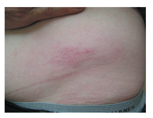
Figure 3. Rash from Figure 2, 2 weeks after treatment.

through August. In this scenario, serologic confirmation is unnecessary and can be misleading because the false-negative rate is as high as 60% in the first 2 to 4 weeks of infection.<sup>2</sup> Despite negative Lyme serology, the EM rash in the setting of fever, fatigue, and neurologic symptoms suggested a diagnosis of acute Lyme disease.