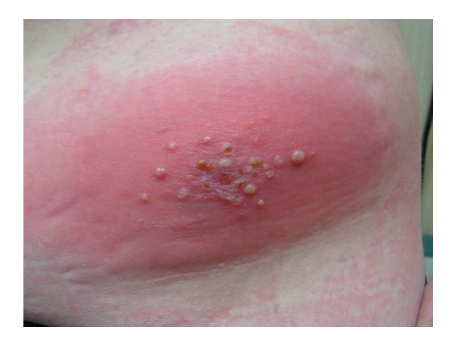
Figure 2. An example of an atypical vesiculopustular variant of the erythema migrans lesion.

Early Lyme disease is a clinical diagnosis in endemic areas in patients presenting with the EM lesion, predominately during the months of May