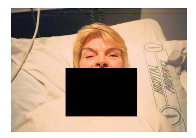
Figure 1. Ptosis, right eye.

ceftriaxone, 2 grams per day, was initiated without the addition of doxycycline or antiprotozoal therapy. Several hours after the first dose, the patient developed a transient exacerbation of her fever, sweats, and rash. Fortunately, she made a consistent and dramatic improvement over the next several days (Figure 3).