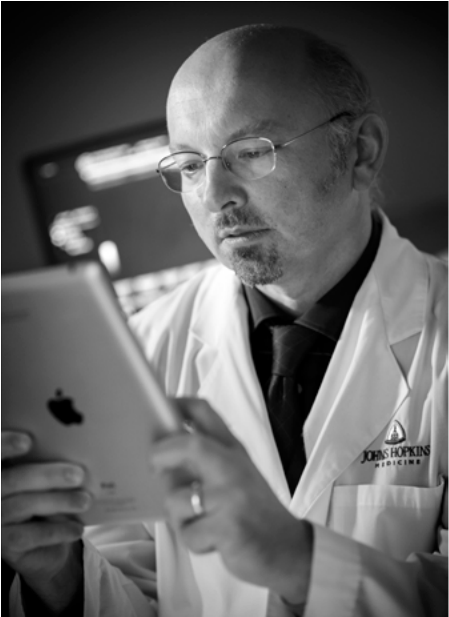
Grader-Beck: Communication is becoming “much more continuous.”

“For patients with a chronic disease, we see them every three to four months, but that is really an old model.”